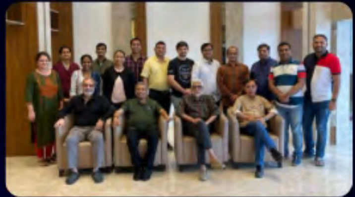
Strategy Meeting, 2021