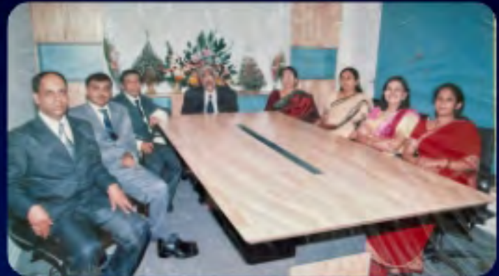
Bizsol Office Pune, 2005