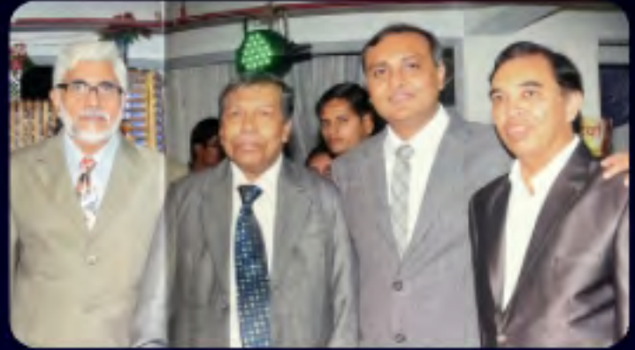
Bizsol House, 2013