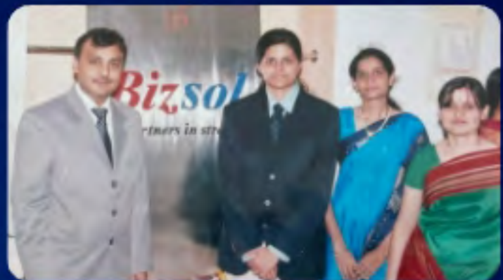
Bizsol Office Pune, 2005