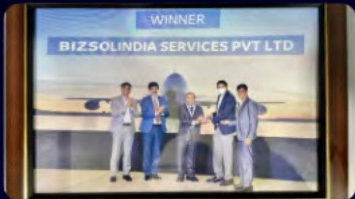
Awarded as Best Business Partner in Financial Services from GE Group

2022 The Journey Continues towards vision Golden Jubilee