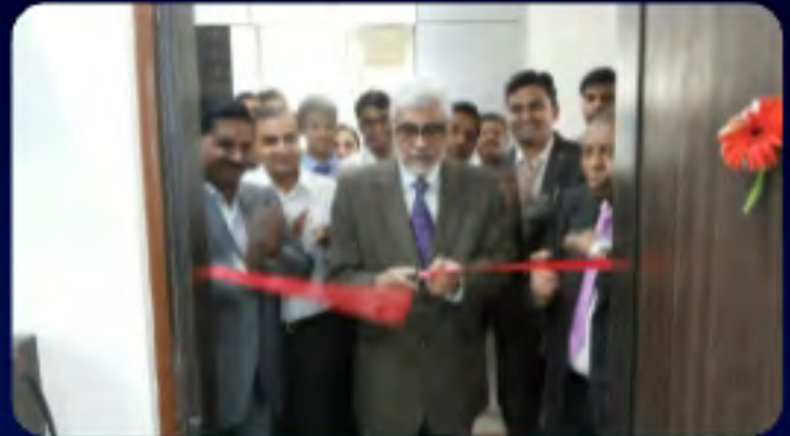
Bizsol Office Aurangabad, 2014