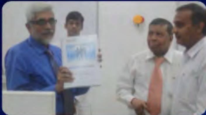
Release of Bizsolites Handbook