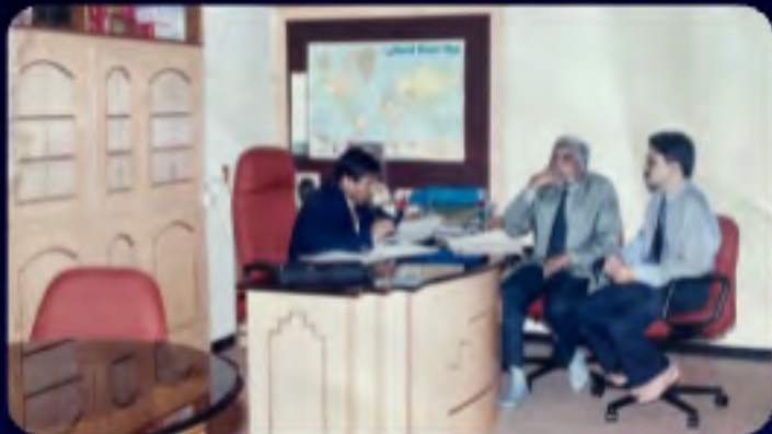
Bizsol Office At Nashik, 2001