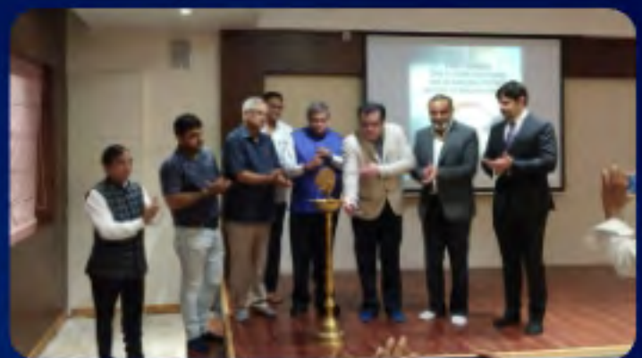
Bizsol Office Satara, 2019