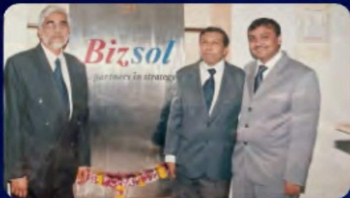
Bizsol Office Pune, 2005