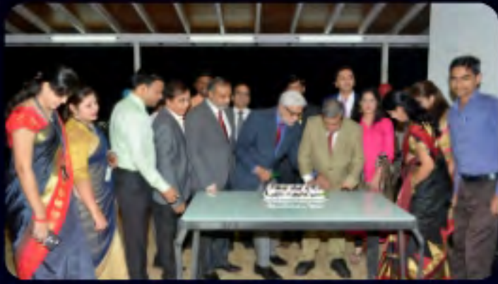
Bizsol House Anniversary