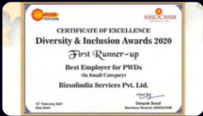
ASSOCHAM Award, 2020